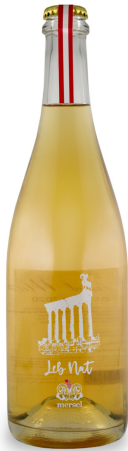
LebNat PetNat Gold